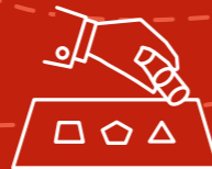
No claims preparation