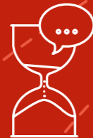
Slow response times