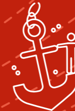
Lack of support