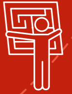
Confusion about how to file a claim