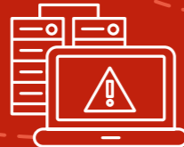
Emerging cyber risks