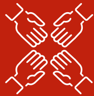
Cultural differences and procedures

Is your company's coverage right for your particular risk profile? Are you equipped to tackle problems and unforeseen events that can impair your business?