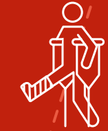
Employee personal injury