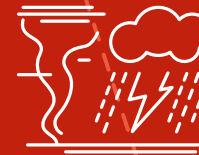
Extreme weather events