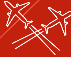
Increased air traffic