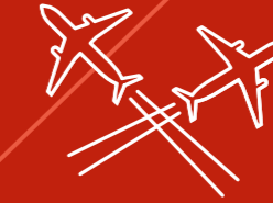
Increased air traffic