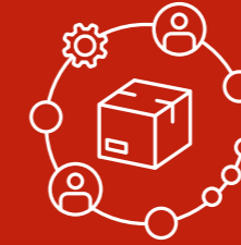
Supply chain management