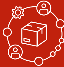
Supply chain management