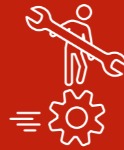
Poor maintenance culture