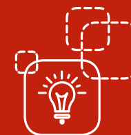
Contingent project liabilities