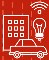
Internet of things